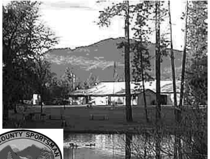
JCSA Pond & Club House